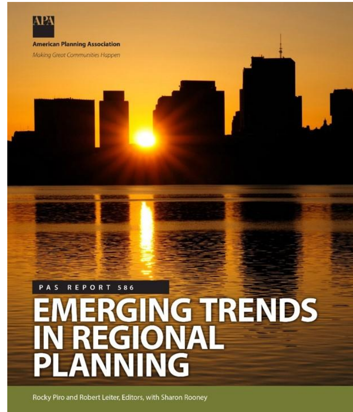
PAS Report 586: Emerging Trends